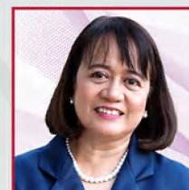
LUZ FILIPINAS S. SAN PEDRO Metal Engraving